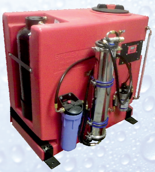
√ Commercial/Domestic Use